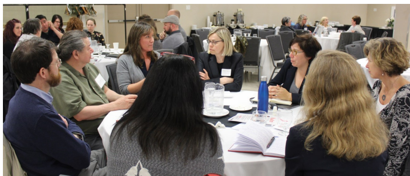
Conference delegates participate in a talking circle.

Talking circles and breakout sessions concluded the conference, and allowed delegates time to share their ideas, and, most importantly, to listen to the concerns and ideas of others.